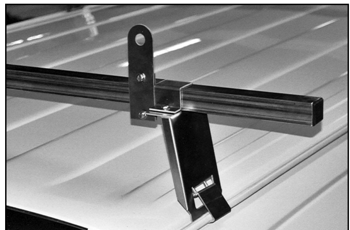
Photo of installed roof rack.

Caution: Some metal edges could be sharp; we recommend wearing gloves during installation.